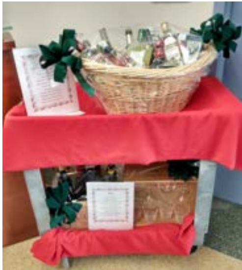
Our “Booze Basket” valued at over $500 includes 10 bottles of wine, 12 mixed bottles of Spirits, Glasses and accessories. Everything in the baskets were donated.